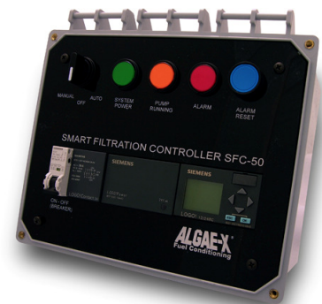
SFC-50 Smart Filtration Controller

The three color-coded lights give an instant visual status report of system power (green), pump running (orange), and alarm (red). The alarm reset is the easily accessible large (blue) push button. The selector switch provides the option of manual operation or running the fully automated program.