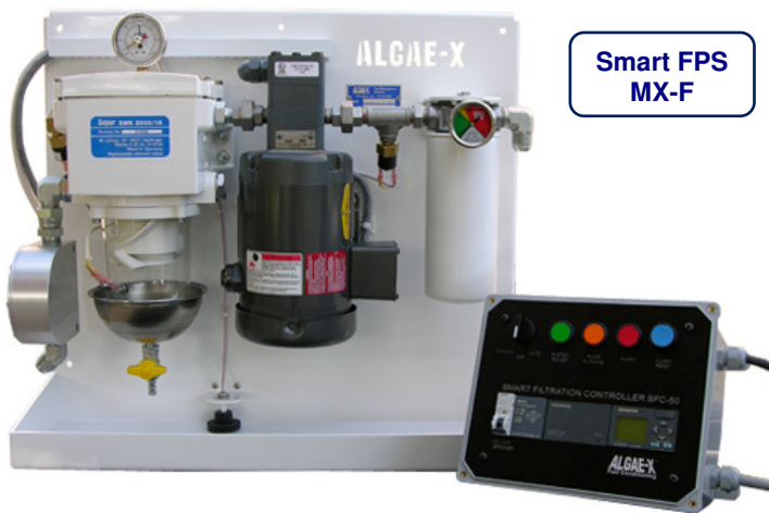
Smart FPS MX-F

Smart FPS Fuel Polishing Systems are equipped with a plug and play SFC-50 Smart Controller with text display.